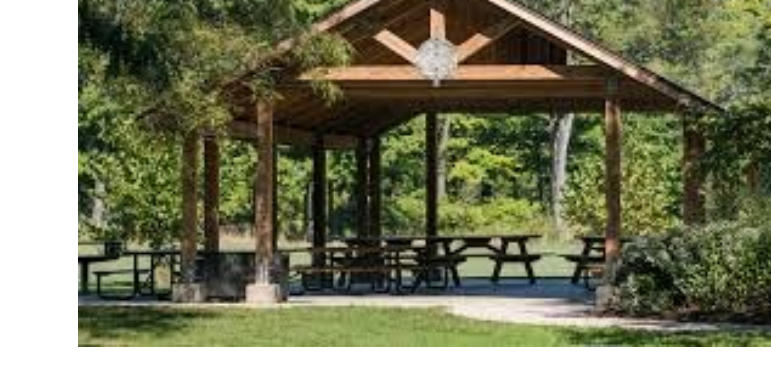
You're not alone. God cares about you. So do we.